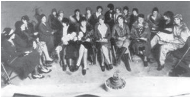
November 2, 1929 – Organizational meeting for what would become The Ninety-Nines, Inc.

Other international-level activities have included hosting two World Aviation Education and Safety Congresses in India in 1985 and 1993, and one in Nepal in 2000.