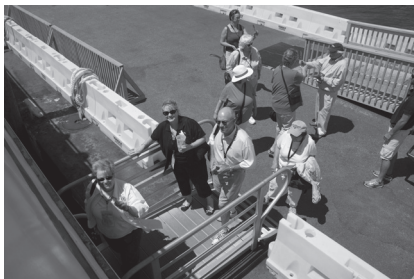
Left: Members board a ferry for a lighthouse tour.