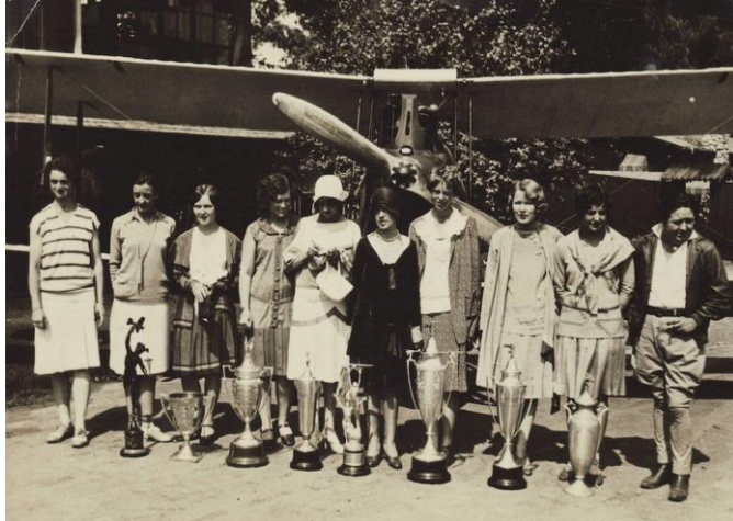
Women pilot competitors pose after completing the 2700-mile Air Derby from Santa Monica to Curtis Field, NY on August 18, 1929

This document was created for the Canadian 99's. Details such as licensing requirements, medical standards, and training costs should be adjusted for your appropriate country/location.