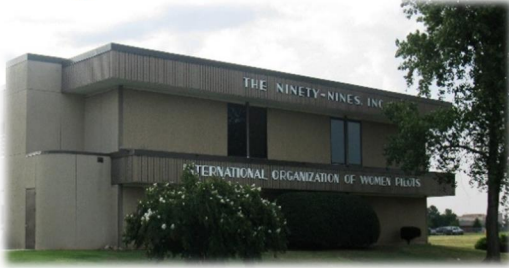
99s Headquarters and 99s Museum of Women Pilots.