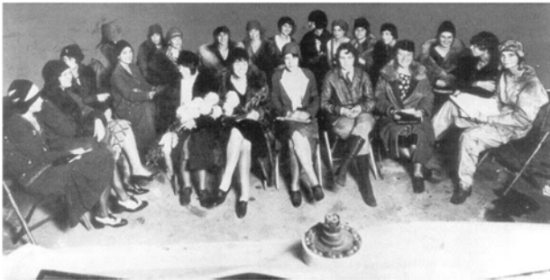
November 2, 1929 – Organizational meeting for what would become The Ninety-Nines, Inc.

Other international-level activities have included hosting two World Aviation Education and Safety Congresses in India in 1985 and 1993, and one in Nepal in 2000.