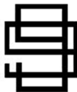
The Ninety-Nines, Inc.

Note: Standing Rules presented are inclusive of all amendments. The history of amendments can be accessed through the Bylaws/Standing Rules Committee.