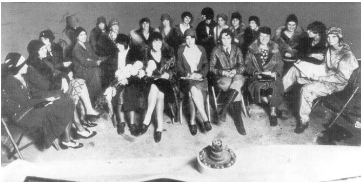
November 2, 1929—Organizational meeting for what would become The Ninety-Nines, Inc.

Other international-level activities have included hosting two World Aviation Education and Safety Congresses in India in 1985