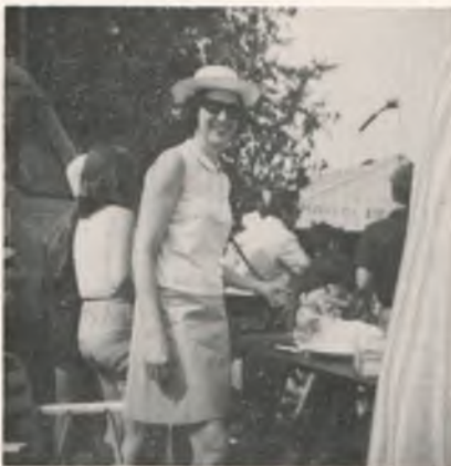
Cake sale at Airshow held at Monroe, Conn. Airport on June 1, 1969. We made $84.00 for our convention fund.