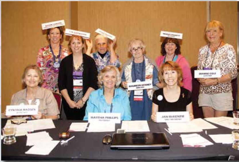
Officers and Directors ham it up for the camera. Just so you won't forget who is who!