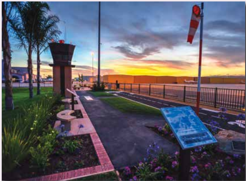
Sunset at The Viewport at Camarillo Airport.