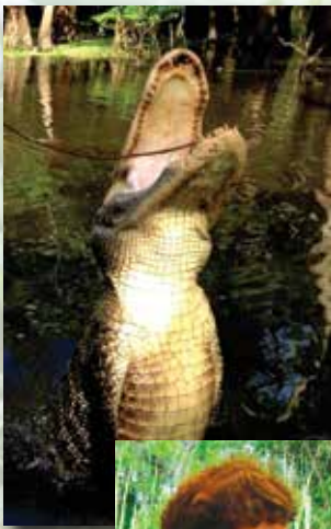
Left, an alligator opens wide for a marshmallow treat.