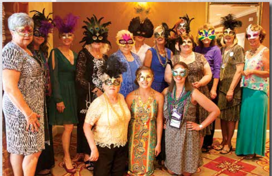
Who are these masked women at Saturday night's pre-banquet cocktail party?