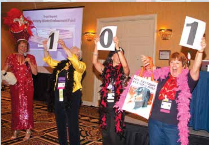
Exciting news: The Endowment Fund tops its one million dollar goal!