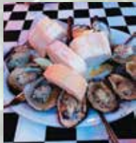
A New Orleans tradition at Acme Oyster House.