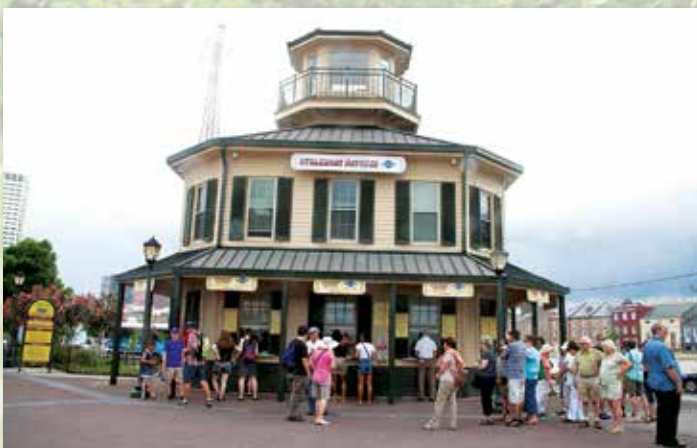
Getting ready to cruise the Mississippi on the Steamboat Natchez.