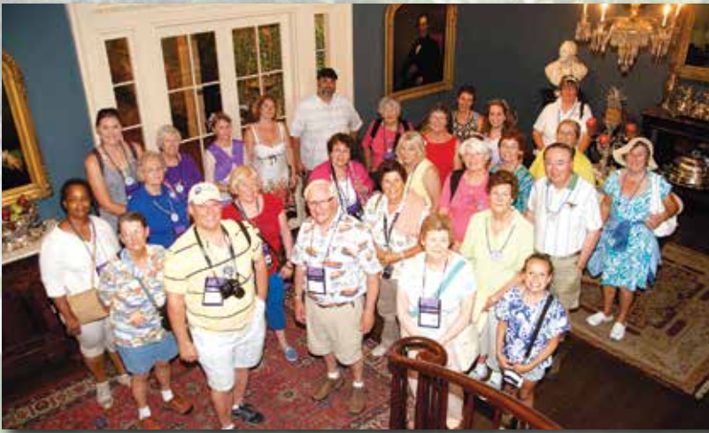
Ninety-Nines step back into history as they begin the plantation tour.