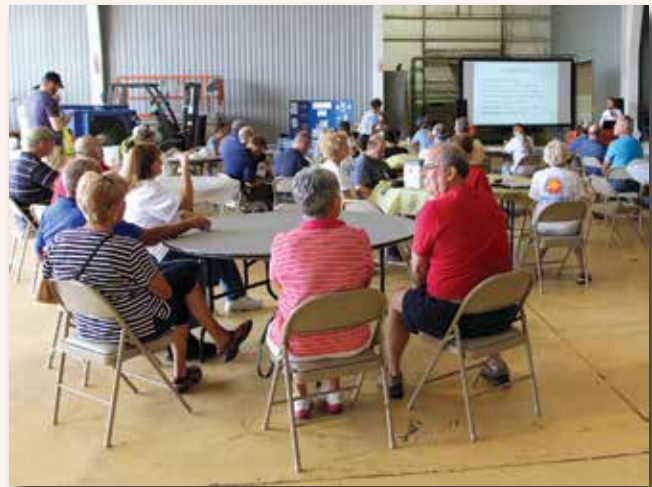
Pre-race briefing at the Okie Derby.