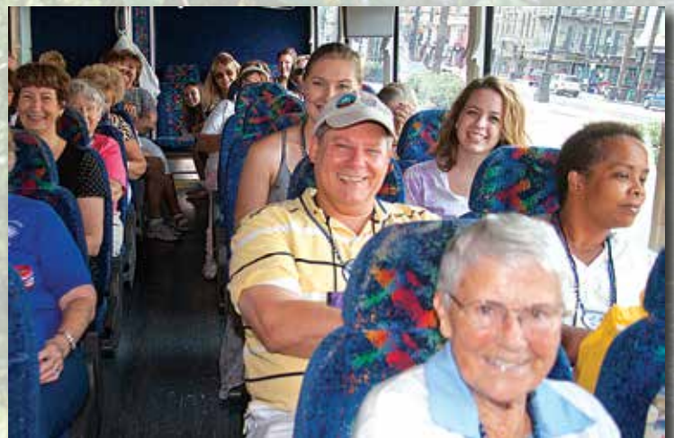
On the bus and ready to tour New Orleans!