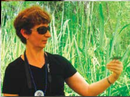
Below, New Zealand Governor Dee Bond gets a close-up look at a grasshopper on the Honey Island Swamp tour.