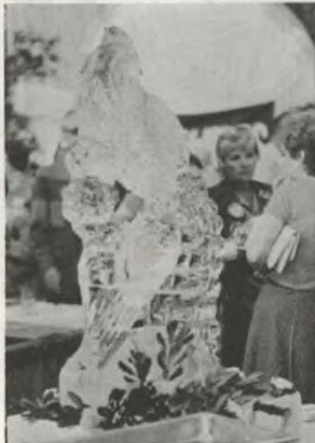
A beautiful ice sculpture is the only remnant of a bountiful table of hors d'oeuvres