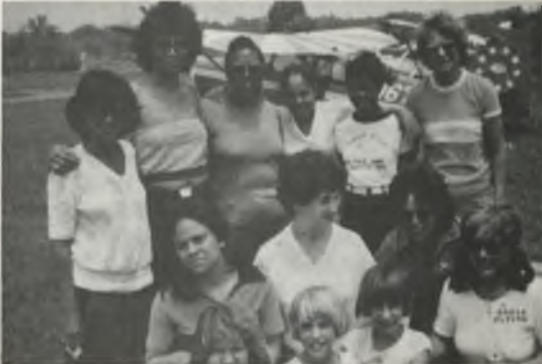
Parents, leaders, scouts and Palisades members gather at Hanover Airport for Essex County Girl Scouts Aviation Day.

The parade theme was "A Nation of Aviators," honoring important historical events in the history of the US from the first flight of the Wright Brothers to the inter-planetary travel of today.