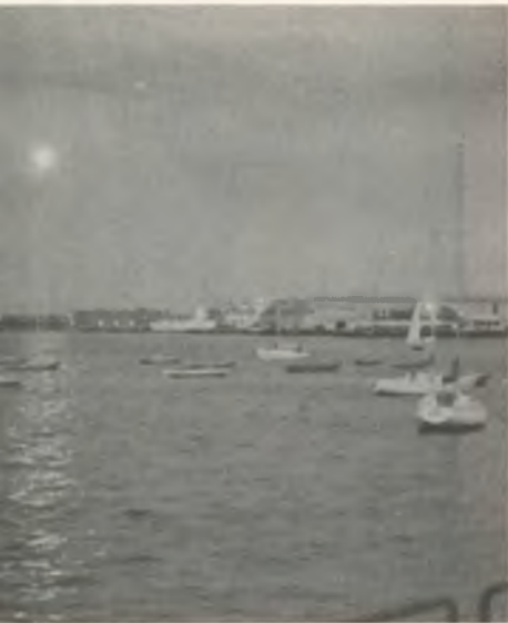
Moonlight above Boston Harbor tops off a great "Clambake" evening.