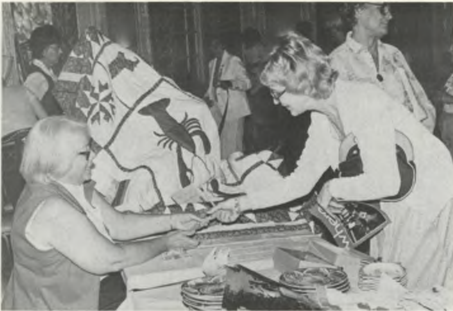
Hubbub Bazaar booths enjoy a brisk business as 99s shop for "goodies".