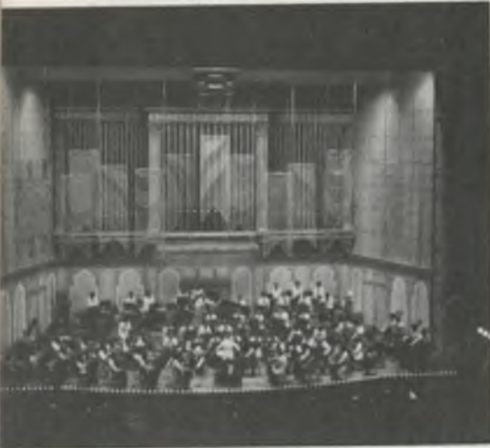
The "Pops" is Boston and many 99s enjoy their regular Friday night concert.