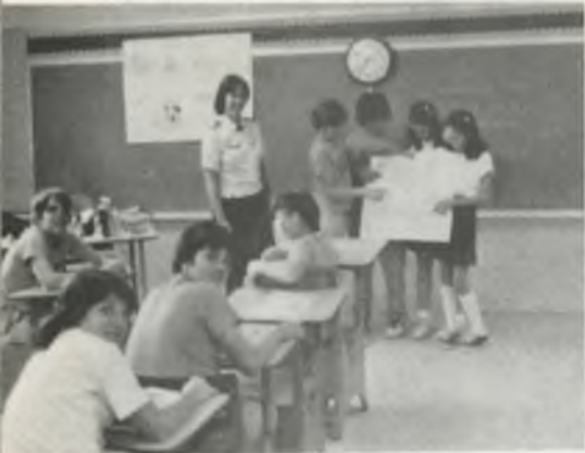
New Orleans 99 distributed 26 aviation packets and gave introductory talks on aviation at local schools. Pictured are seventh grade students at Our Lady of Perpetual Help School in Belle Chasse, La. who are helping to show an aeronautical chart of the state to their class.