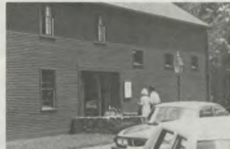
The Museum of National Heritage at Lexington houses displays of American Indians, clocks, pictures and seals of the fifty states.