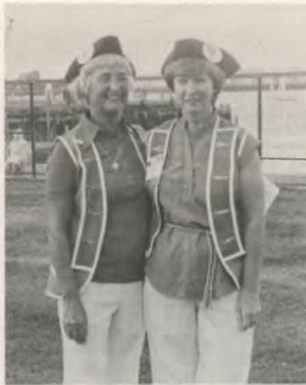
Colorful red vests and black tri-cornered hats identify New England 99s working with the Convention.

Afternoon time was devoted to educational seminars, Hubbub Bazaaring, etc. Then it was time to relax, change into jeans, climb aboard a bus and head for the Boston Aquarium and the evening's entertainment — a clambake. What can we say about the fabulous aquarium — a 60 foot high tank, filled with ocean creatures of all kinds — with a spiral ramp all the way to the top for pedestrian viewing? Then there was the clambake itself . . . on a grassy plot behind the aquarium overlooking Boston harbor . . . a cool night with a beautiful full moon . . . and lots of good food being cooked before our hungry eyes. Lobster, steamed clams, barbequed chicken, corn on the cob, slaw and all the trimmings. What a feast . . . and if you want to see something funny, just watch an inlander tackle a whole lobster . . . it was work to get to the meat, but good when the job was done.