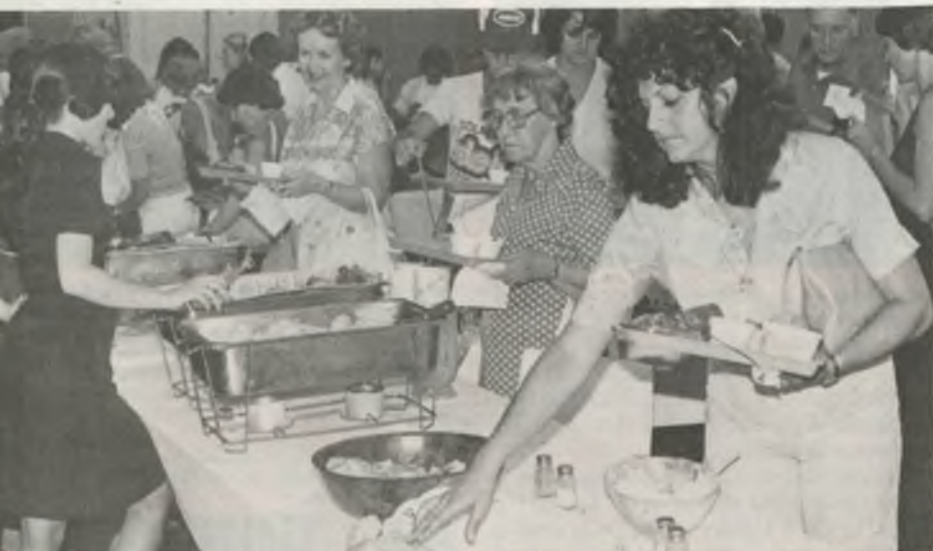
Lining up for lobster, 99s enjoy New England hospitality.

A group of 99s finds eating a lobster a real challenge, and fun as well.