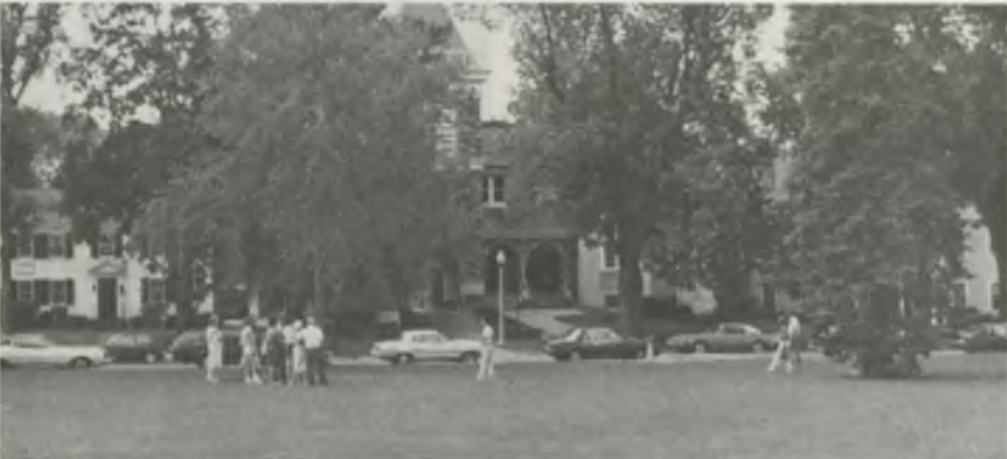
At Lexington Square, visitors were given the story of the start of the American Revolution. The guide felt strongly that the first shot was fired here, although there are others who believe that it was at Concord.