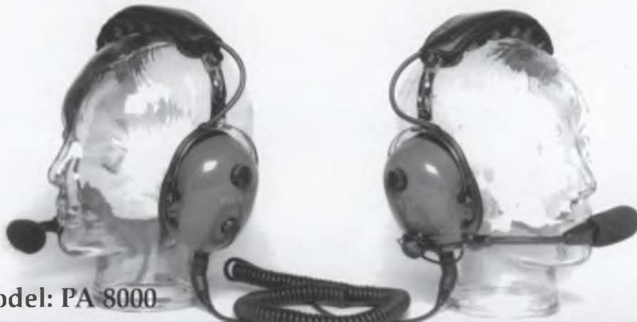
Model: PA 8000