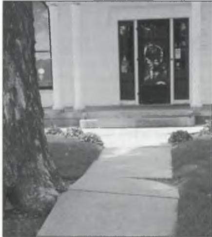
This photo of the old front walk shows how tree roots have pushed the sidewalk up and broken it. It will be replaced and relocated with two front walks which will be constructed of personalized bricks.

E XTERIOR RESTORATION of the Amelia Earhart Birthplace is progressing nicely. Jake Weber, Weber Construc-