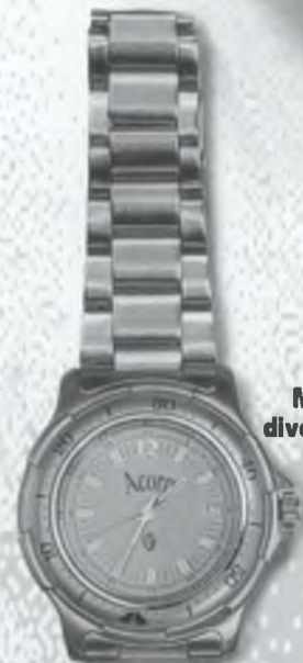
Men's dive watch