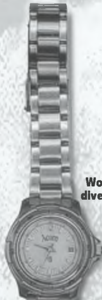
Women's dive watch