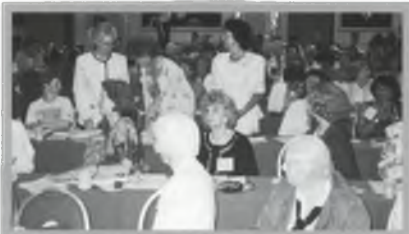
Business meetings were held Friday and Saturday mornings.