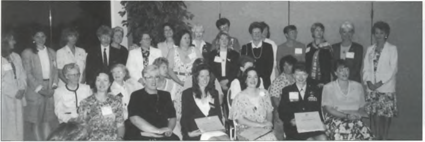
Present and past recipients of AE Scholarships were introduced at Amelia Earhart Scholarship Luncheon.