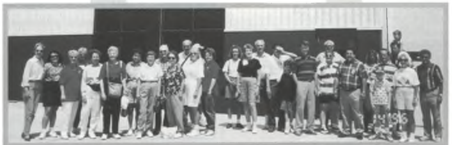
99s and friends tour the new Cessna single engine factory in Independence, Kan.