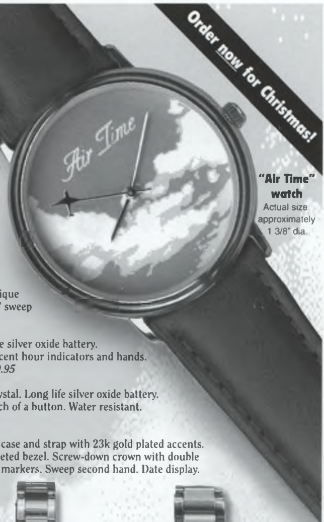
"Air Time" watch Actual size: approximately 1 3/8" dia.