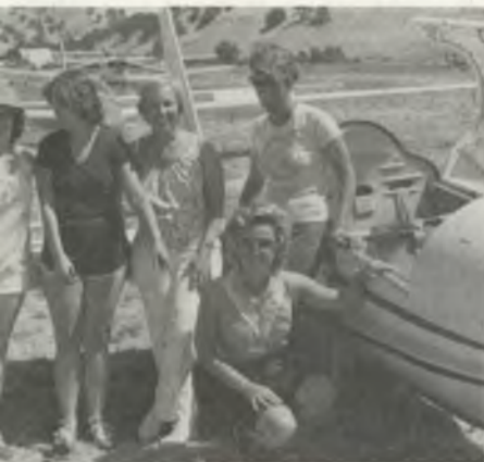
Monterey Bay Chapter members gather to airmark Vaca gliderport.