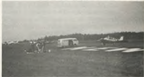
Bill and Betty Griffith's API van helps block off the wind down the taxiway as Oregon Pines gals and 49½ers airmark Newport, Oregon. Fog hung overhead, and the wind blew the paint — but we did the job!

At our August 25 flyout for dinner at Albany, the racers showed slides and photo albums of the race, and the rest of us vowed