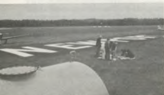
Some of the Oregon Pines members and 49½ers work on the clean-up following the airmarking.

able to report our news earlier this year. May I quickly capsulize our special events?