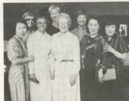
US 99s visit with their Korean sisters.