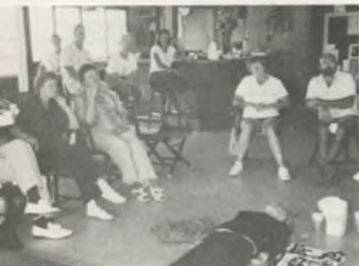
Davis Island Yacht Club was the scene of Florida Suncoast's CPR course.