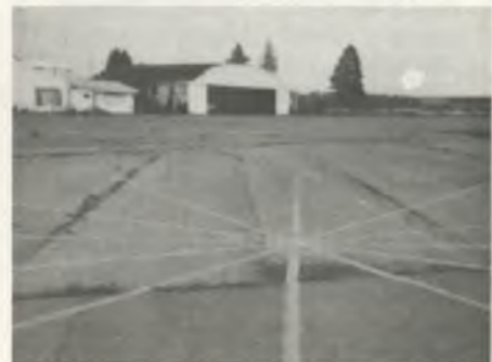
New York Capital District 99s recently painted compass check markings at Schenectady County Airport.