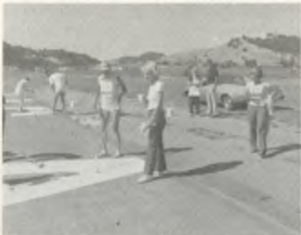
Several 99 chapters combined efforts to airmark a gliderport at Vaca, California.