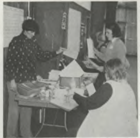
Clockwise from above: Air age education workshop involves 99s and young students. Fundraising at an air show helps keep projects going. Chapter meetings are sometimes held in a hangar. 99s help flying companions learn more about aviation. Pennies-a-Pound flights give folks a chance to experience the thrill of flight. Fly-ins for fun lead to a picnic at the airport.