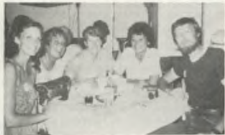
A few Wisconsin 99s and a 49½er gather to discuss the day's activities at the EAA convention.