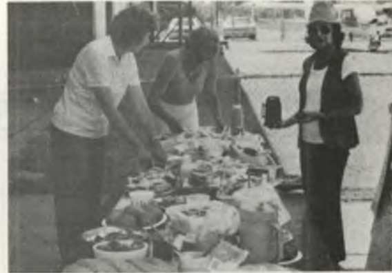
A bountiful pot luck picnic in the shade of a hangar at Welland Airport was enjoyed by First Canadian members.

More events are coming up rapidly. Plans for another fly-in, our annual general meeting in September, and the Fall Section Meeting the first weekend in October.