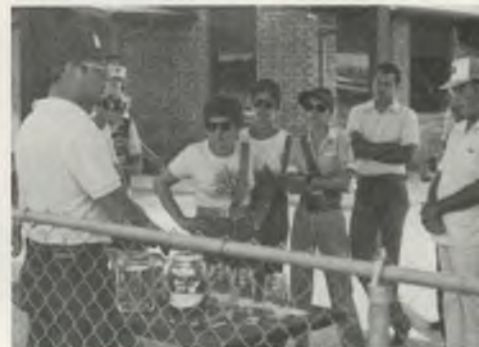
Watching the fuel display are San Antonio 99s and other pilots.

Oklahoma Chapter members take a coffee break during airmarking efforts at Fairview, Oklahoma, Airport.