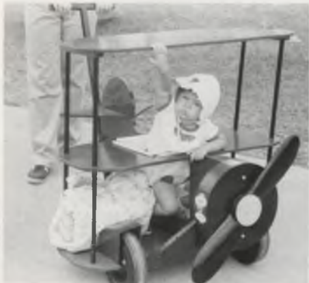
They come in planes of all sizes and shapes to Oshkosh.