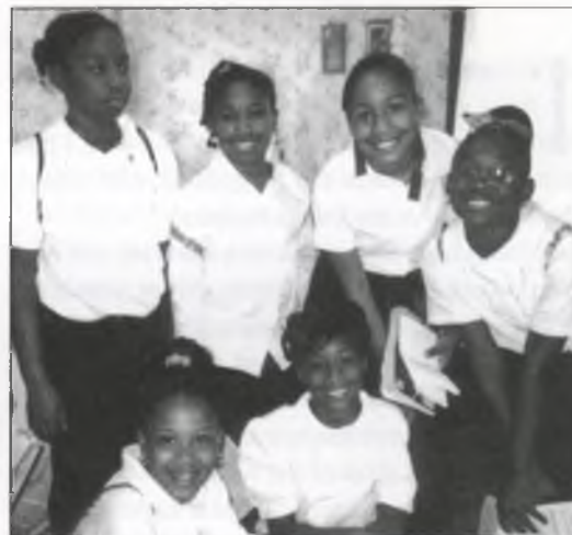
Students from the Faith Academy, Kansas City, Missouri visit the museum.

Several employees of Rockwell Collins in Cedar Rapids, Iowa have volunteered their time to assist Nauticos Corporation of Baltimore, Maryland locate Amelia Earhart's plane in the