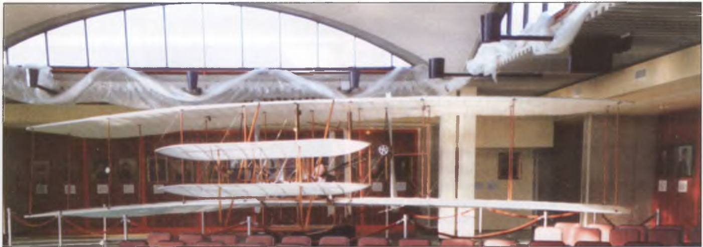
Photos, opposite page: A 60-foot granite monument dedicated in 1932 is perched atop 90-foot tall Kill Devil Hill commemorating the achievement of the Wright Brothers. Inset opposite page: Four markers honor the four flights made by Orville and Wilbur on December 17, 1903. Above, the replica of the Wright Flyer.

Saturday we were up early for breakfast and then out to the grounds for more activities. The weather was great, warmer and a lot less wind. This day was full, and I do mean full, of Girl Scouts from the Girl Scout Council of Colonial Coast. They flew kites, climbed the hill to the Wright Brothers Monument, climbed in and out of helicopters and, of course, made Alka Seltzer rockets. Saturday was a little different as lots of adults accompanied the girls. The WASP were still with us and continued to be a big hit with everyone.