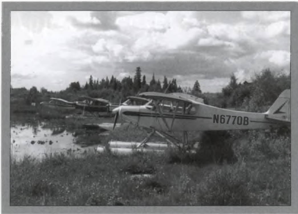
Super Cubs park at Shannon's Pond.

It's part of the attraction of Alaska that requires wilderness savvy in those who spend time here. This element either scares people away or draws them back for the rest of their lives.