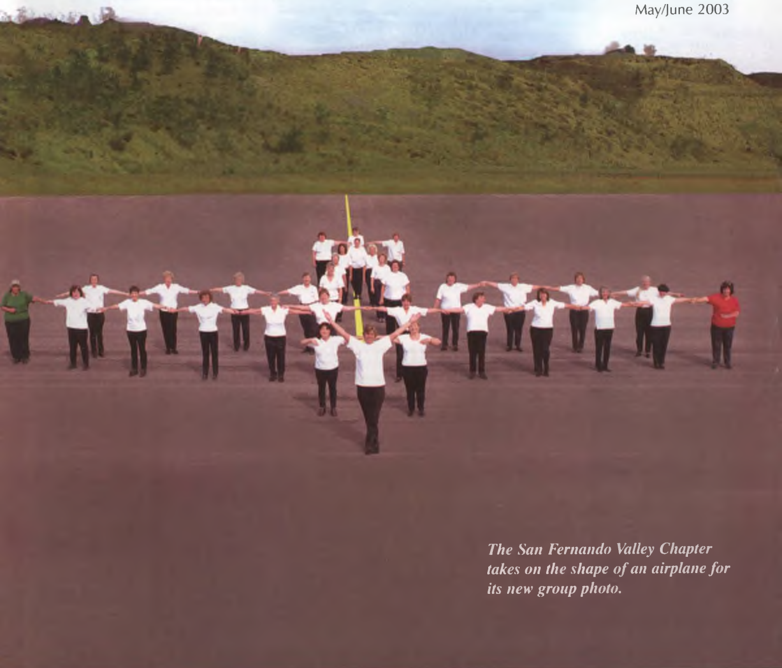
The San Fernando Valley Chapter takes on the shape of an airplane for its new group photo.