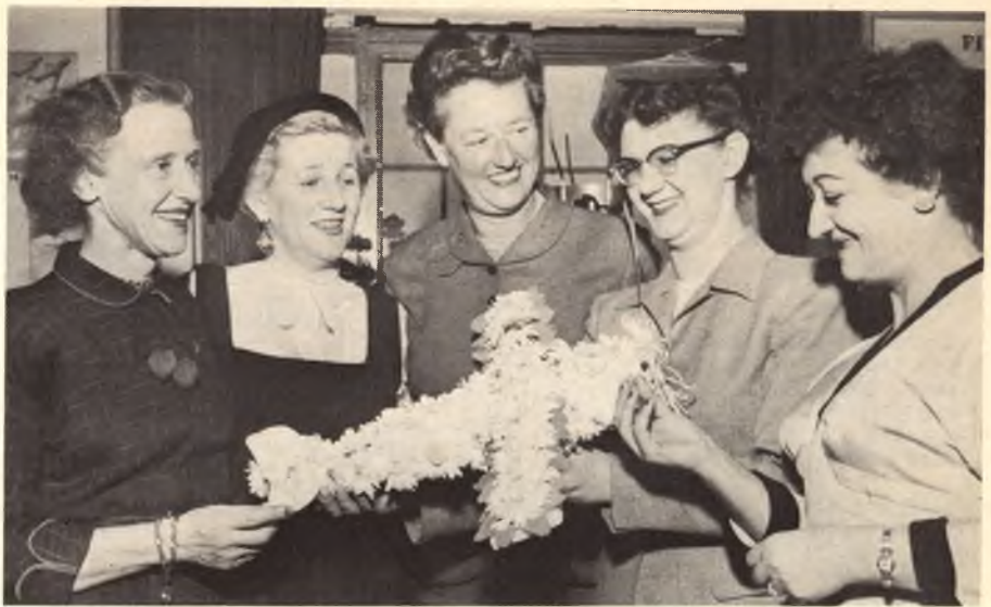
ADMIRING THE CENTERPIECE at the Akron Meeting in November Akron, Ohio