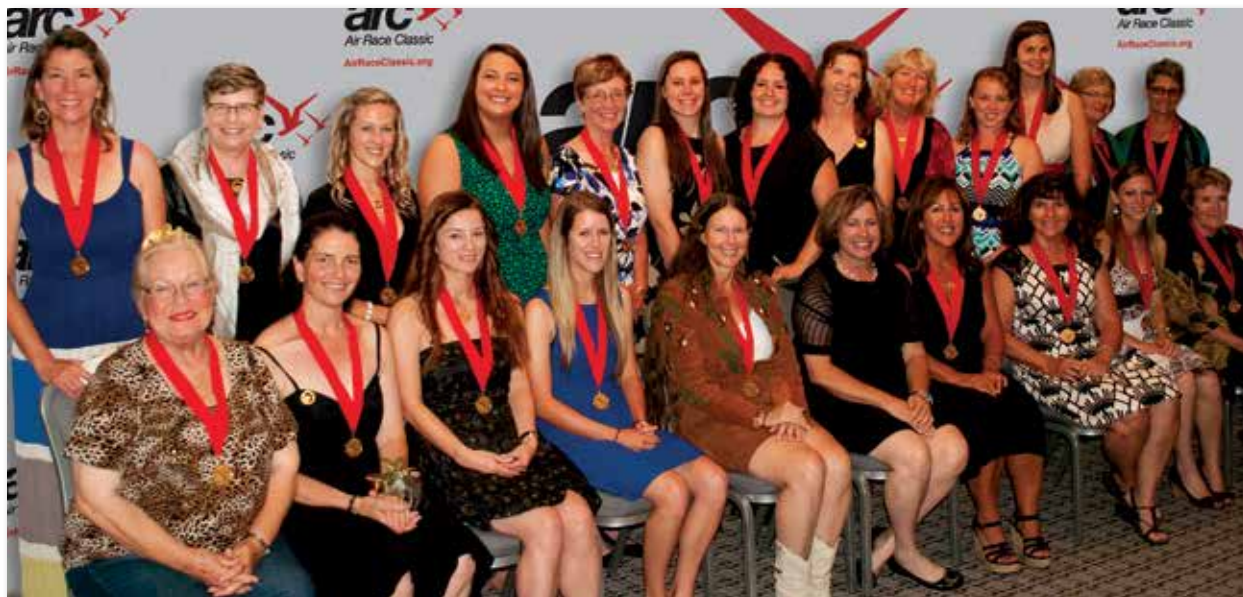
Top 10 Air Race Classic 2013 winners in the spotlight. See opposite page for winners, in order from left.

During the race we looked after ourselves and each other by keeping ourselves hydrated and eating enough protein — and sleeping well at night. The various challenges we met were overcome together, as a team. Communication was open and constant. We often sang in the airplane, had fun, laughed and, on one afternoon, we even had a massage!