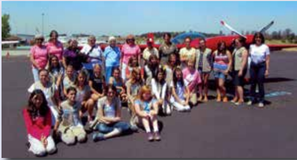
Girl Scouts enjoy a day with members of the Placer Gold Chapter.