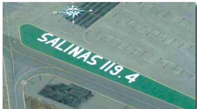
Completed Monterey Bay airmarking at SNS Airport. Note the plane swinging its compass on the compass rose.