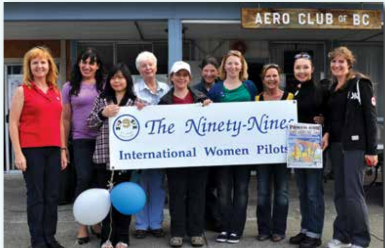
British Columbia Coast members at their Poker Run on June 1.