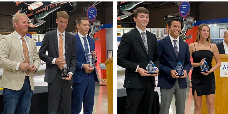
Left: Top Schools – 3rd place Polk State College, 2nd Auburn University, 1st Embry Riddle Aeronautical University.