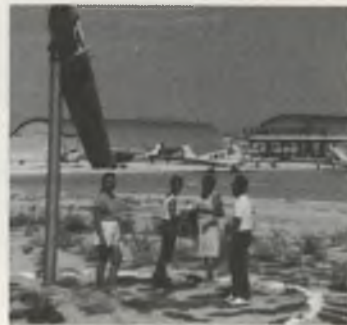
BOMBS AWAY—El Paso 99s prepare markers for the flour bombing contest at West Texas Airport.

We joined Chaparral chapter members for a tour of the North American Institute of Aviation in