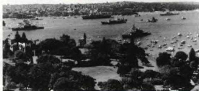
BICENTENNIAL CELEBRATION—Navy Day in Sydney Harbor, taken from the American National Club penthouse. There were 63 capital ships in the harbor from all the world's navies.