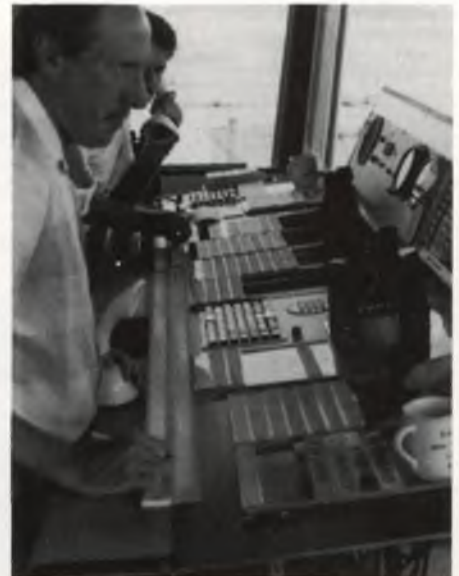
THIS IS IT!—Cairns Tower, the total of ATC for airport and enroute above 8,000" north of Brisbane airspace - and they do it without radar. Their FSS handles low level enroute; this may be the only airport in the world with no radar and regular 747 traffic.