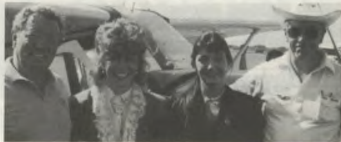
From Sandra Vogelpohl of Florida Spaceport chapter:

Three new members were introduced, one from Ft. Myers and two from outside Florida -- Alaska and Spain.