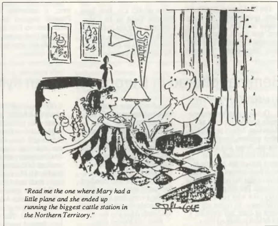
"Read me the one where Mary had a little plane and she ended up running the biggest cattle station in the Northern Territory."

Be assured we love to share its beauty with visiting 99s and also to share our mutual abiding interest in all aspects of aviation.