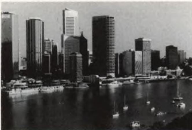
ACROSS THE "BRIZZY"—The city of Brisbane shines.