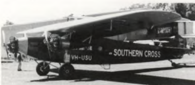
AIRSHOW ENTRANT—This replica of Charles Kingsford Smith's Fokker Southern Cross flew at Richmond Airshow. The original has been restored and is displayed near Brisbane International.