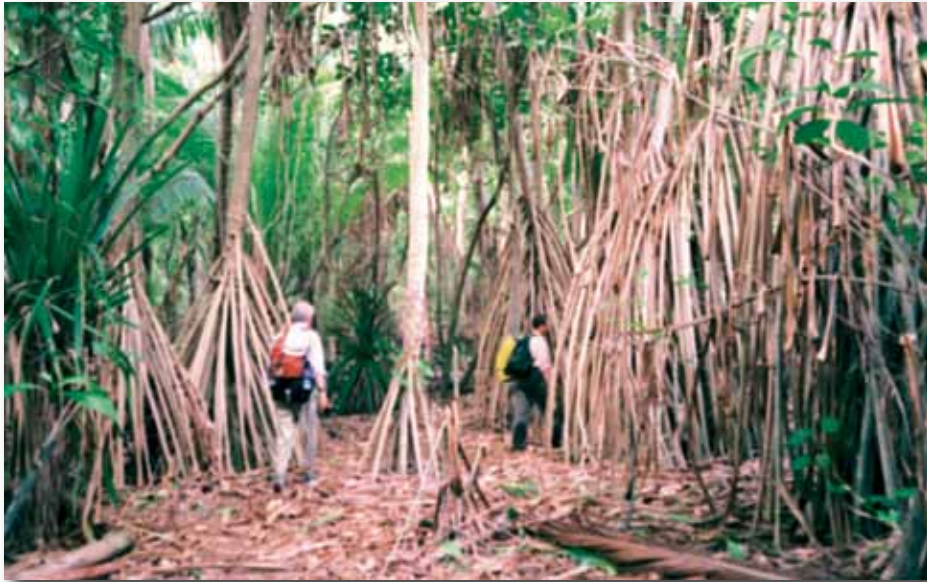
The team searches carefully through Pandanus trees. Their serrated edges can easily slash ankles.

It is on this same area that the new TIGHAR expedition will focus in July this year. Last year's expedition used an underwater robot that gave the team a new look at the underwater landscape. It had been thought that the reef tapered off at a 45 degree angle to about 2,500 feet, but the 2010 Niku VI expedition discovered that at 984 feet the slope became more shallow. At this depth the last faint traces of light start to fade to total blackness of the ocean so that any aircraft wreckage should not be obscured by coral growth. They will go back with a better underwater robotic device and attempt to search there and even deeper.