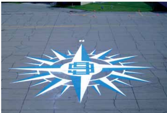
St. Paul Airport.

Typically, the cardinal points of a compass rose are 35 feet