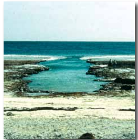
Niku's front door at low tide.