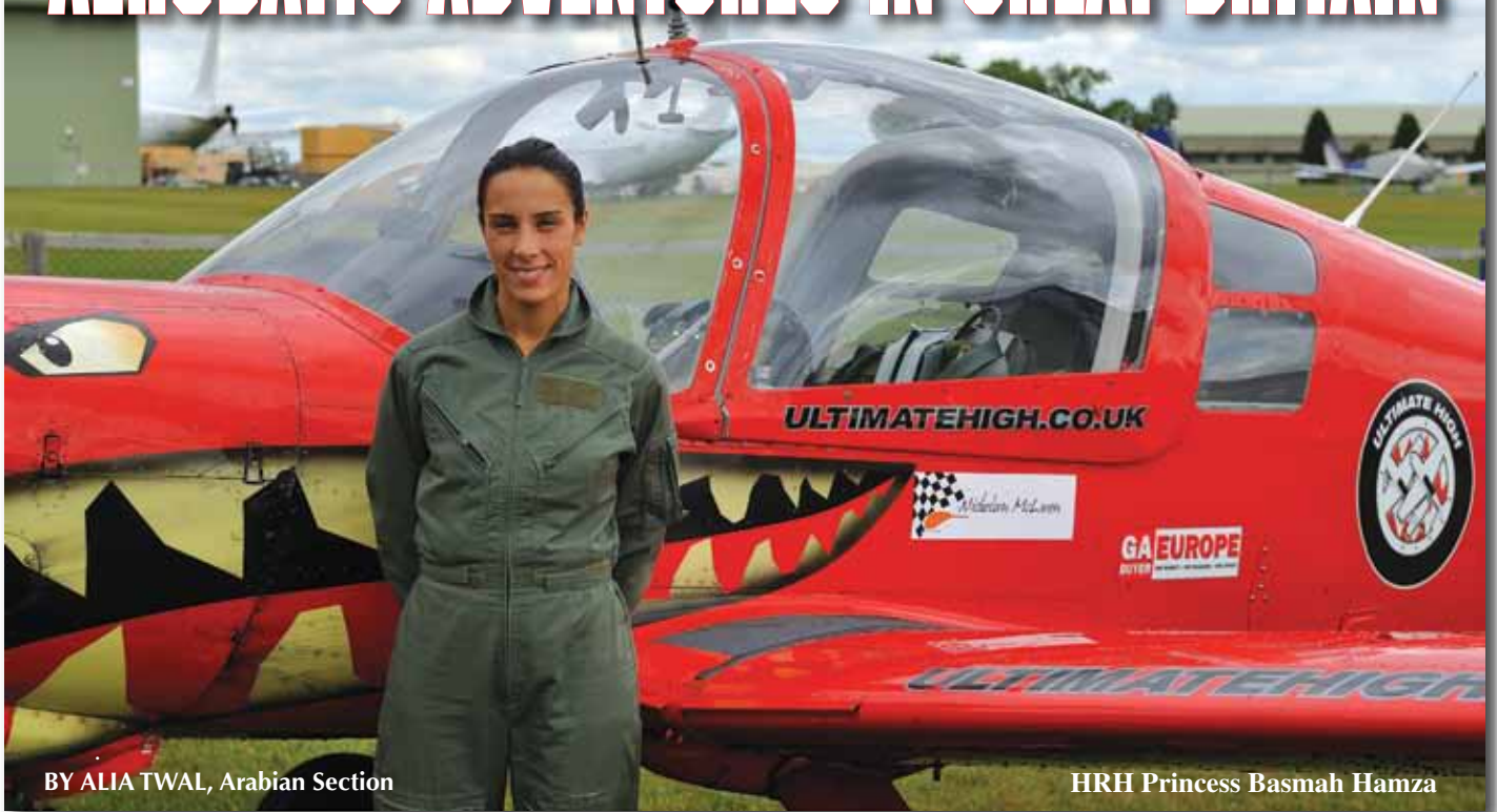
BY ALIA TWAL, Arabian Section