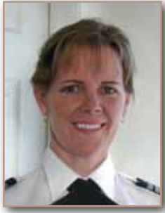
BY DONNA MILLER International Careers Committee