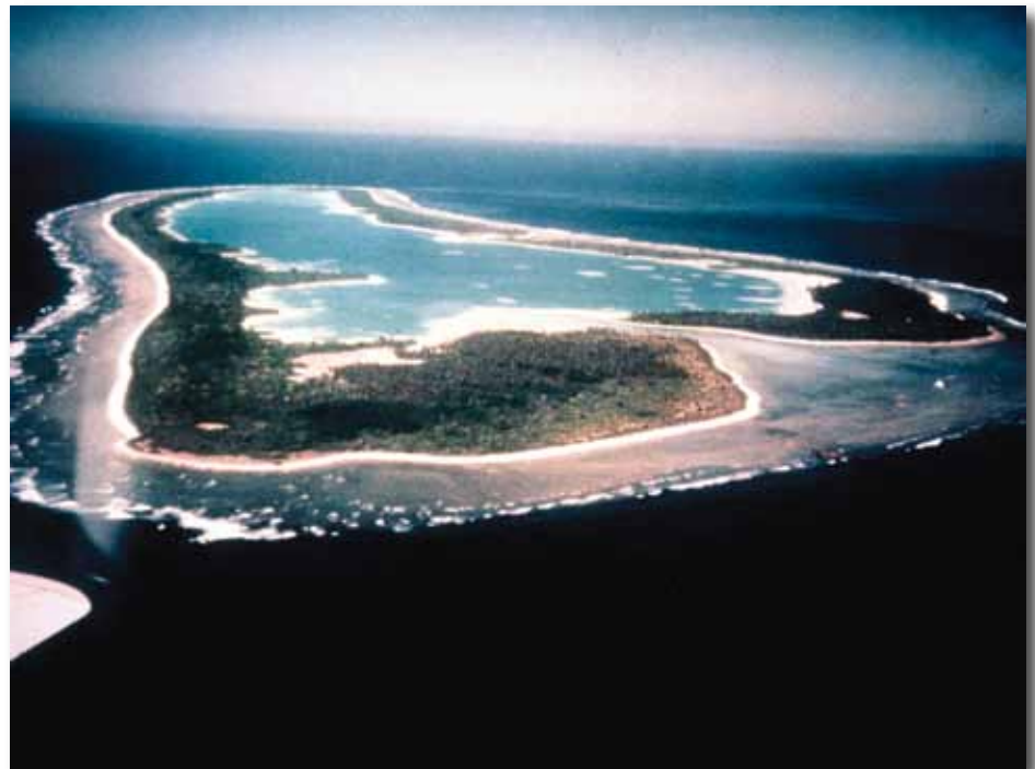
Amelia's view of Niku. The reef at the bottom of photo is the suspected landing site just left of the wreck of the Norwich City and the inlet to the lagoon.