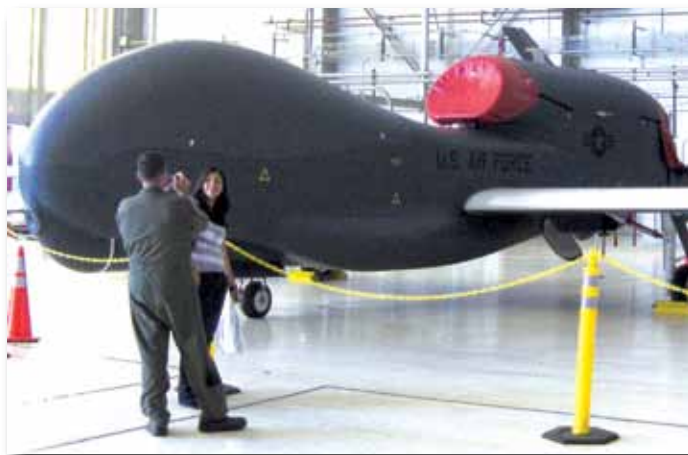
U.S. Air Force Global Hawk, a high-altitude, remotely piloted reconnaissance aircraft.

Upon departure from Edwards Air Force Base, one can only feel great appreciation for those folks who have decided to safeguard The United States of America for the rest of us. We were privileged to be in their company. Salute!