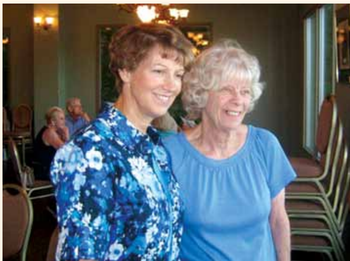
Astronaut Eileen Collins with Ann Pellegrino, who completed a world flight in 1967 that closely mirrored Amelia's flight plan in 1937.

picture on the front of the newspaper because planting a 30-foot tree is quite an event. A dedication of the tree will be held during the 2012 Forest of Friendship, Saturday, June 16, at 2:30 p.m. Refreshments will be served.